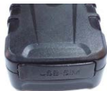
Close the dust cover

The LEDs light solid whilst searching for both GSM and GPS signals. After approximately, 20~40 seconds the LEDs should start to flash. Reminder, the tracker must be outdoors or very close to a window/door to receive GPS signals. Once signals are acquired, it can be initialized as detailed on the following pages. After a short while, the LED's will turn off to preserve battery life.