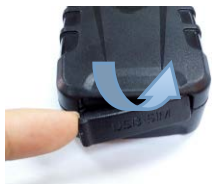
Lift the rubber cover