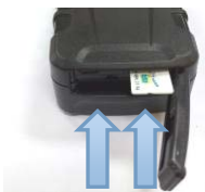
Insert the SIM card & turn on