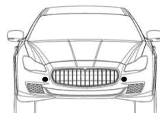
2 sensors 60cm-80cm

Rated voltage: 12v Operating voltage: 10.5-15vDC Rated current: 20mA-200mA Detection range: 0.2-1.3m Frequency: 40KHz Working temp: -30c~+80c